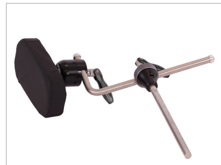
RECTANGULAR LATERAL POSITIONER