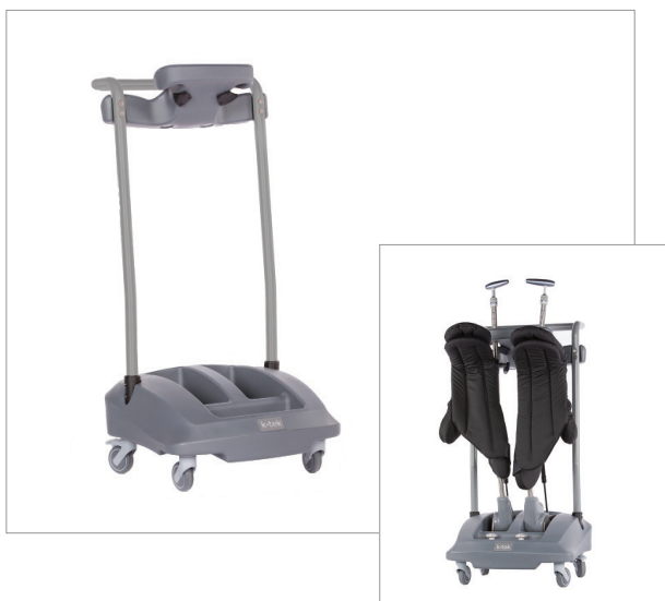
Stirrups not included