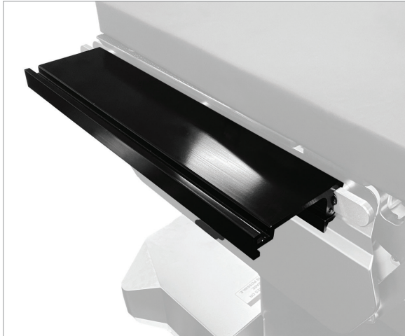
Table Width Extender