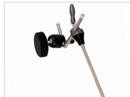
CIRCULAR LATERAL POSITIONER