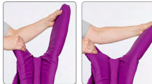
FLEXIBLE BOOT ACCOMMODATES DIFFERENT LEG SIZES