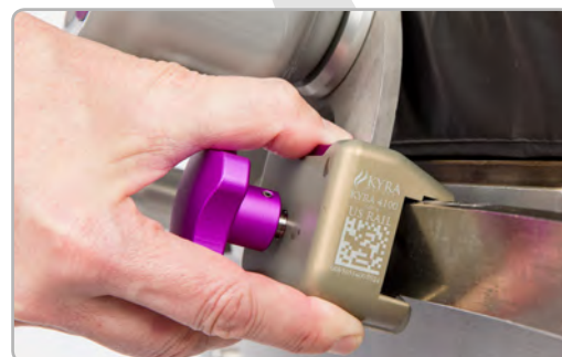
NO MORE LOST CLAMPS! OPTIONAL INTEGRATED CLAMP