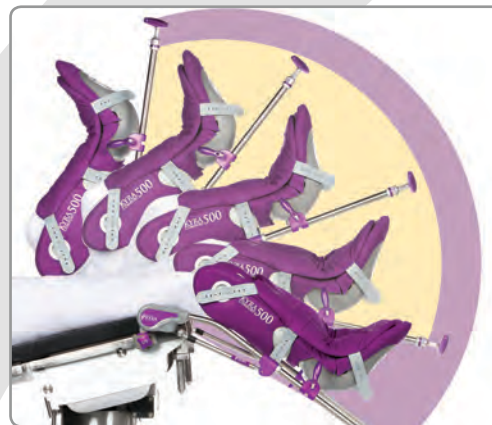
140° LITHOTOMY RANGE OF MOTION